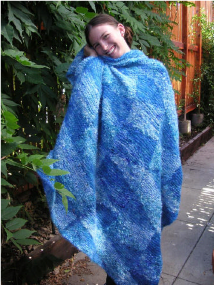
Knit sample shown in colorway Glacier Lakes

This blanket is worked in strips of short rowed wedges, alternating 3 yarns. The yarns can be three different yarns of the same colorway or three colorways of the same yarn. The first will give a rich, textural result, the latter, a splashy play of color.